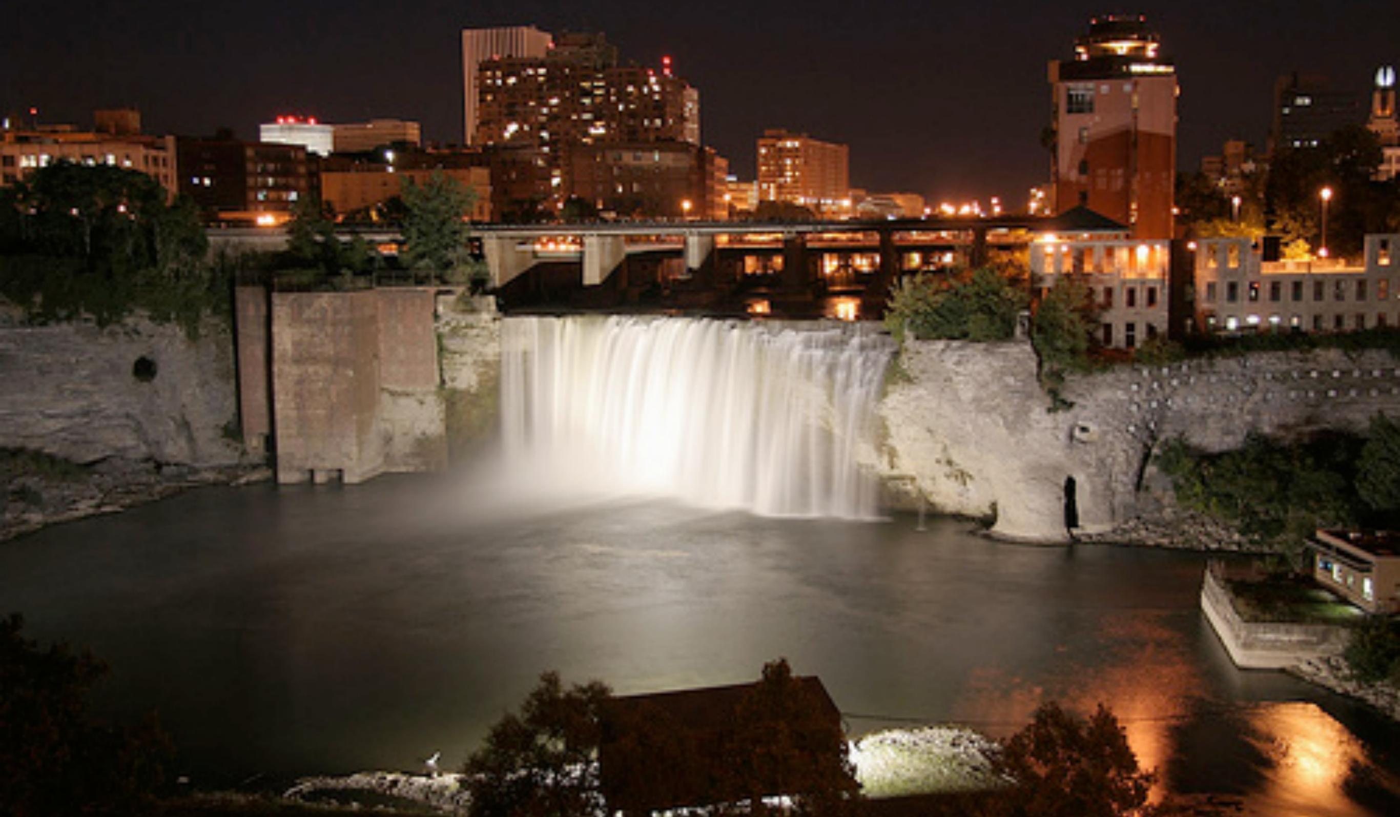
High Falls in Downtown Rochester